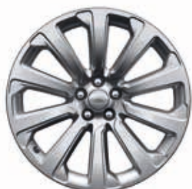
20" 10 SPOKE 'STYLE 1032'