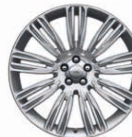
22" 9 SPLIT-SPOKE 'STYLE 9007'