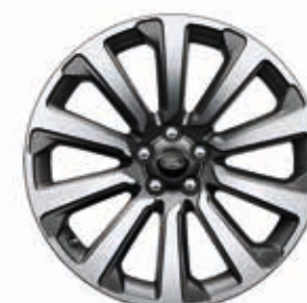
20" 10 SPOKE 'STYLE 1032' WITH DIAMOND TURNED FINISH