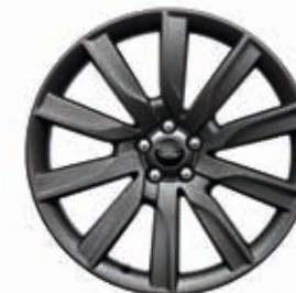
21" 10 SPOKE 'STYLE 1033' WITH SATIN DARK GREY FINISH