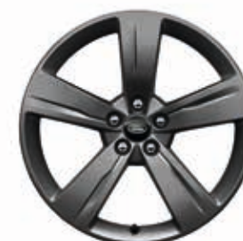
19" 5 SPOKE 'STYLE 5046' WITH SATIN DARK GREY FINISH