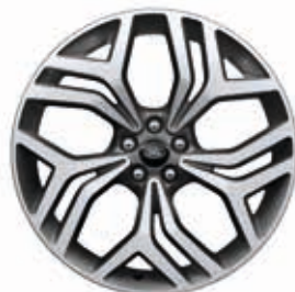
21" 5 SPLIT-SPOKE 'STYLE 5047' WITH DIAMOND TURNED FINISH