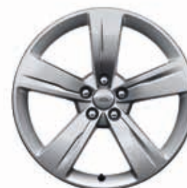
19" 5 SPOKE 'STYLE 5046'

Distinctively designed and superbly engineered, our wheels are available in a choice of designs, fully fitted, aligned and balanced.