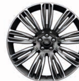
22" 9 SPLIT-SPOKE 'STYLE 9007' WITH DIAMOND TURNED FINISH