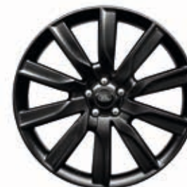
21" 10 SPOKE 'STYLE 1033' WITH GLOSS BLACK FINISH