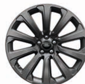
20" 10 SPOKE 'STYLE 1032' WITH SATIN DARK GREY FINISH