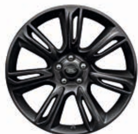
20" 7 SPLIT-SPOKE 'STYLE 7014' WITH GLOSS BLACK FINISH