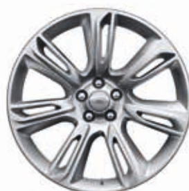
20" 7 SPLIT-SPOKE 'STYLE 7014'