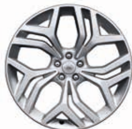
21" 5 SPLIT-SPOKE 'STYLE 5047'